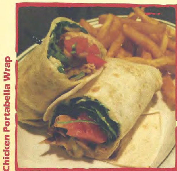
Chicken Portabella Wrap

Grilled or crispy chicken with romaine lettuce, tomatoes and Caesar dressing in a regular or wheat wrap 8.50